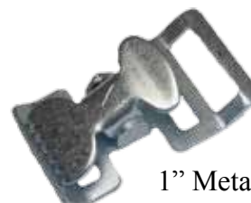
1" Metal Web Buckle