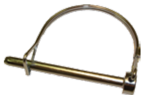
2" Pin & Bail