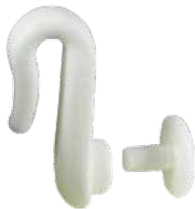
Nylon Wall Hook