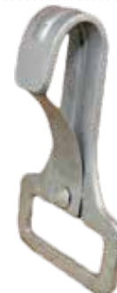
Metal Wall Snap